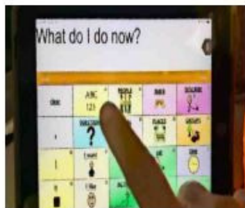
TouchChat on Ipad

Westboro Warrior about it. Afterwards, have your family communicate with each other by using only non-verbal ways such as writing, drawing, gestures or facial expressions. Thanks for helping us to raise awareness.